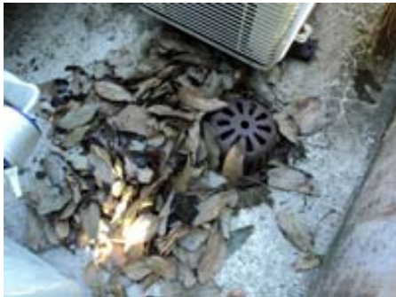
leaves block the water drainage