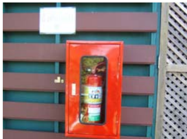
at pump room opposite P11