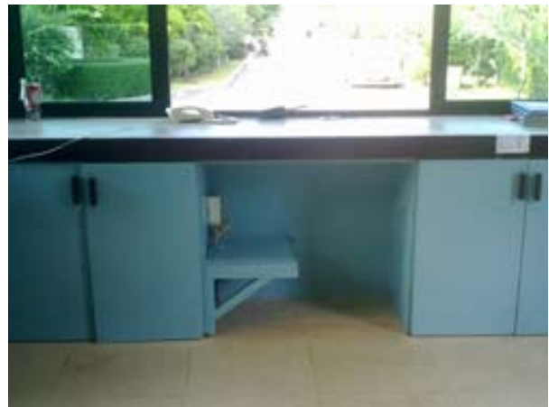
in main entrance security house