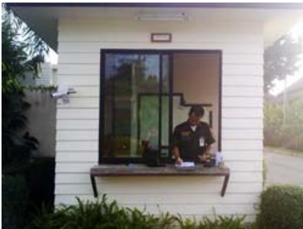
Baan-Pratum security house