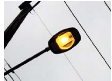
after work is done