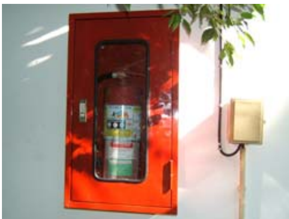
at water pump room behind P44